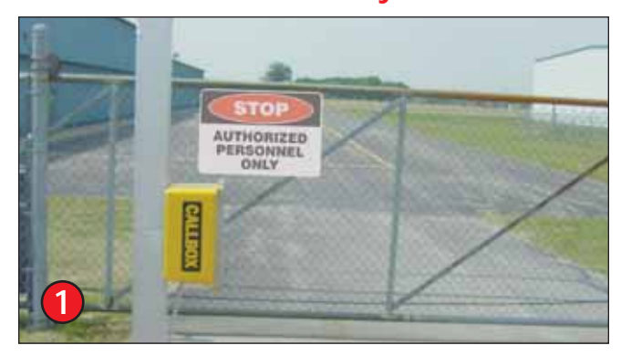
Visitor/delivery person arrives at secured gate area.