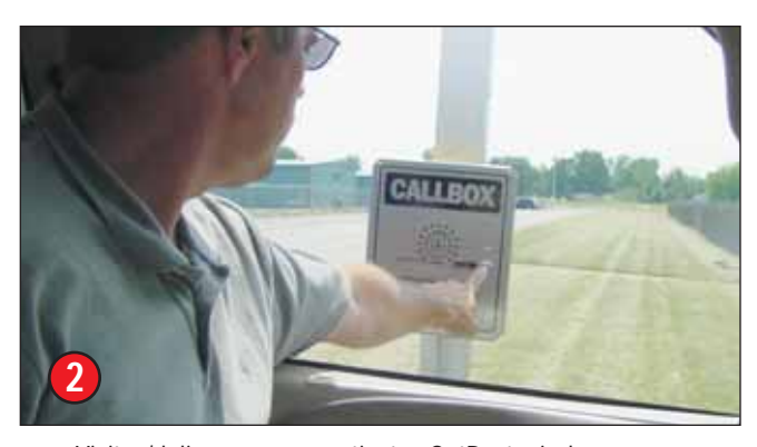
Visitor/delivery person activates OutPost wireless intercom/callbox to announce their arrival.