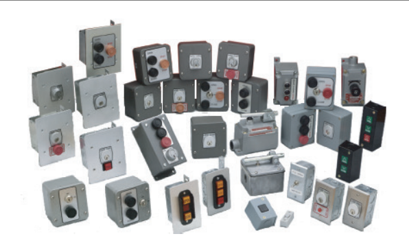
Complete selection of control stations & accessories are available.

All gate operators must have contact and non-contact sensing system installed for operator to work properly and safely.