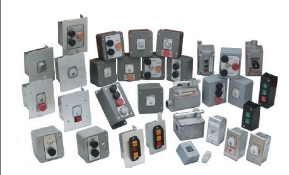
Complete selection of control stations & accessories are available.

All gate operators must have contact and non-contact sensing system installed for operator to work properly and safely.