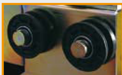
Ball bearing wheels