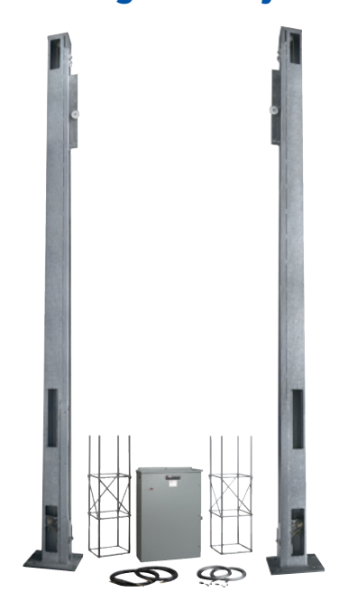
8 models: Up to 80 ft and 2,000 lb gate panel. 1 or 2 ft/s.