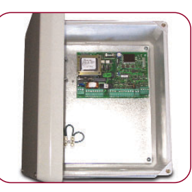
Model 455 D control panel in 10 in. x 12 in. enclosure (standard).

Environmental factors can change the performance of the operator.