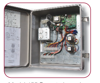
Model 455 D control panel in 14 in. x 16 in. enclosure (optional).