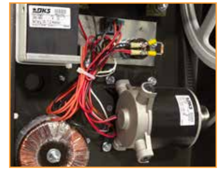
dc motor and battery backup for continued gate operation if AC power is lost